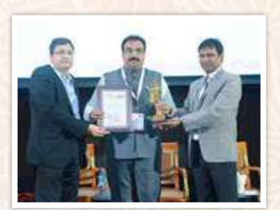
Sacred Heart School, Kalyan, India